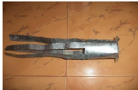
Fig 2. Turbulence Inducer