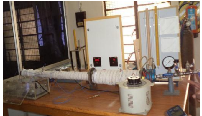
Fig 1. Experimental equipment