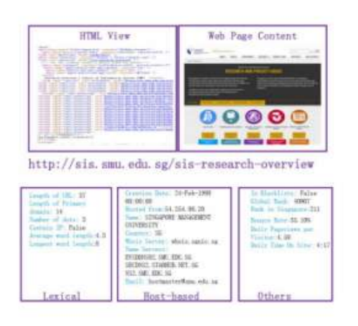
Figure -3.1: Example of information about a URL that can be obtained in the Feature Collection stage

The goal of machine learning for malicious URL detection is to maximize the predictive accuracy. Both of the folds above are important to achieve this goal. While the first part of feature representation is often based on domain knowledge and heuristics, the second part focuses on training the classification model via a data driven optimization approach. Illustrates a general work-flow for Malicious URL Detection using machine learning. The first key step is to convert a URL u into a feature vector x, where several types of information can be considered and different techniques can be used. Unlike learning the prediction model, this part cannot be directly computed by a mathematical function (not for most of it). Using domain knowledge and related expertise, a feature representation is constructed by crawling all relevant information about the URL. These range from lexical information (length of URL, the words used in the URL, etc.) to host-based information (WHOIS info, IP address, location, etc.).