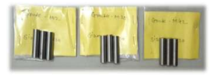
Fig -2: Photograph of Pin Specimen