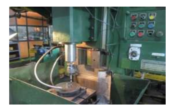
Fig -4: Performance testing machine