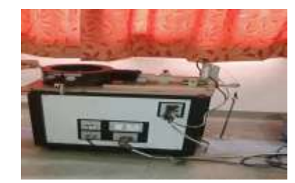
Fig -3: Pin on disc wear test apparatus

Wear Test is conducted on Pin on disc Apparatus as shown in fig-3.