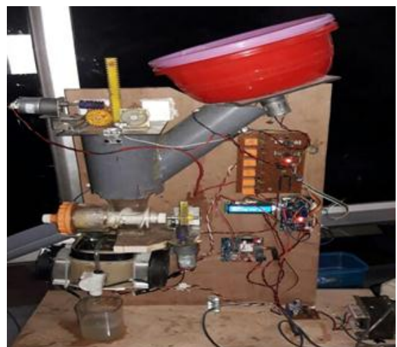
Figure1: fresh juice vending machine

The utility model discloses a freshly extracted orange juice vending machine. The freshly extracted orange juice vending machine comprises a raw material cabinet, a discharge mechanism, an extraction mechanism, a cutter, a juice output mechanism and a control mechanism, wherein the discharge mechanism comprises an upper guide pipe, a lower guide pipe, an ejection block and a lifting mechanism which can drive the ejection block to move up and down; the discharge end of the upper guide pipe and the feed end of the lower guide pipe face to each other and are staggered vertically; the discharge end of the lower guide pipe and the extraction mechanism face to each other; the extraction mechanism comprises two concave die rollers with a plurality of concave ball grooves, two convex die rollers with a plurality of convex balls and a transmission mechanism which drives the rollers to synchronously rotate, and is used for extracting oranges; the cutter is installed below the junction of the two concave groove rollers; the juice output mechanism comprises a juice collection hopper, and an opening is formed below the juice collection hopper and is connected with a juice guide pipe. It acquires approx. 2-3 unit in 24 hrs. The dimensions of machine is 2*1.5*2.5 feet. These dimensions are selected randomly as per ease of fabrication.