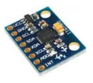
Fig -4: Gyroscope module

These are the devices which sense the angular velocity. They are also called as angular rate sensors or angular velocity sensors. The MPU6050 gyroscope consists of a 3axis gyroscope, 3-axis accelerometer and a Digital Motion Processor (DPM).