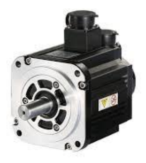
Fig -3: Servo motor

A servo motor is an electrical device which can push or rotate an object with great precision. If you want to rotate and object at some specific angles or distance, then you use servo motor. It is just made up of simple motor which run through servo mechanism. It consists of a suitable motor coupled to a sensor for position feedback. It also requires a relatively sophisticated controller, often a dedicated module designed specifically for use with servomotors. Servomotors are not a specific class of motor, although the term servomotor is often used to refer to a motor suitable for use in a closed-loop control system. Servomotors are used in applications such as robotics, CNC machinery or automated manufacturing.