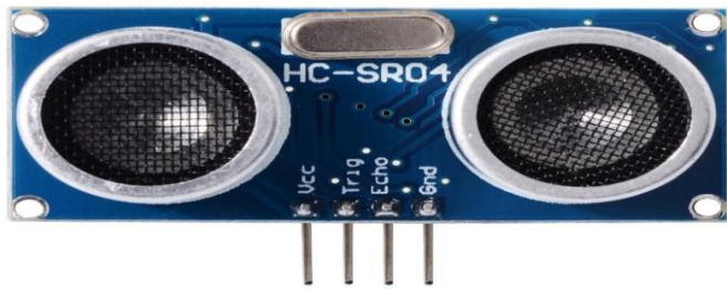
Figure 2: Ultrasonic Sensor