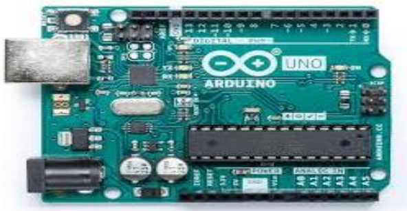
Figure 3: Arduino

It's a single-board microcontroller, designed to make the application of interactive objects or environments more accessible. Sense the environment by receiving input from variety of sensors. Can be programmed with the Arduino software IDE. The Atmega328 on the Arduino Uno comes pre burned with a boot loader that allows us to upload new code to it, without the use of an external hardware programmer.