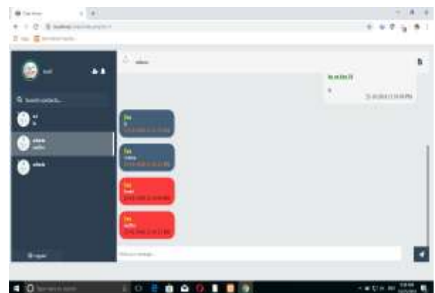
Fig 4.2 Blocking area of dissimilar keywords

Keywords are which is set by the admin for chatting purpose.