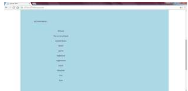
Fig 4.1 keywords stored in database

Keywords are which is set by the admin for chatting purpose.