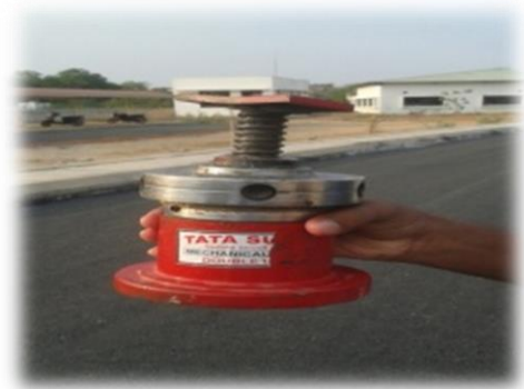
Fig 2 Hydraulic jack

A hydraulic jack uses hydraulic power. Jacks are usually rated for a maximum lifting capacity (1.5 tons or 3 tons).