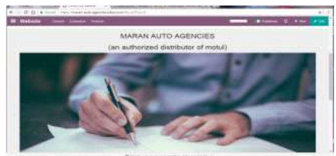
FIG – 1: website development page

When we are developing a separate website for the lubricant distributing industry a separate main menu should be developed and it should be consist of menu like products list, offers etc.It should also consists of separate menu for online shopping. It will separately displays the product details with its specifications. using this option online purchase can be done .So it will improve the sales efficiency [5].