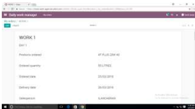
Fig -4: Daily work scheduled page