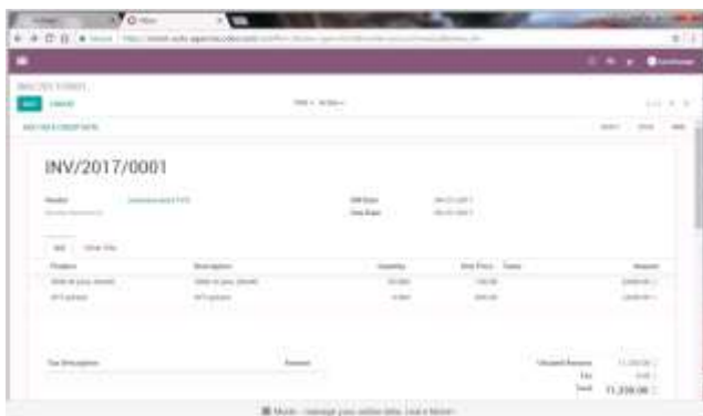
Fig -3: Invoice creation page in separate database