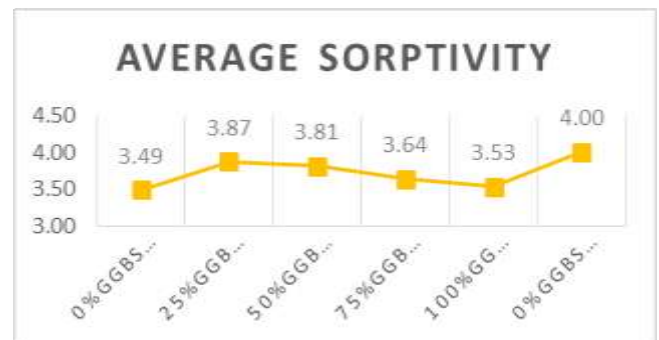
Chart-3: Variation in Soroptivity