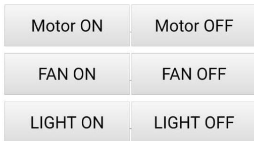
Figure 2. Front End of the application

The Arduino controller is activated through code written in Embedded C using Arduino Integrated Development Environment (IDE). Arduino (IDE) is a free, integrated toolset and environment used for programming Arduino processor. The program instructions are passed to the controller using a USB cable. The Front End is designed using HTML. It is appended with the code to invoke Arduino controller. Figure 2 illustrates the front end of the application.