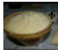
Figure 2: GEL