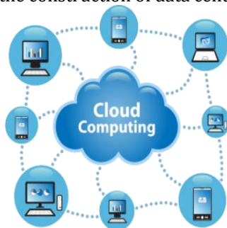
Figure 1. Cloud Technology

Cloud technology submits to a hosting equipment that the hardware, software, association and other possessions are amalgamated to accomplish the computation, storage space, dispensation and distribution of the information in the extensive area arrangement or restricted region association. It is a merchandise of the enlargement of grid compute, disseminated compute, usefulness compute, virtualization equipment and overhaul tilting equipment. Cloud compute constructs filled utilize of Internet to congregate a huge numeral of software and hardware possessions to form a enormous collection of possessions. the commonplace consumers can take pleasure in the IT examine supply by Internet. Cloud computing military are separated into IaaS, PaaS, and SaaS three types. This document colligates the solutions of dissimilar manufacturer, and assembles a cloud computing structural design. Cloud computing arrangement is a four layers arrangement including: SOA component layer, the middle layer of management, resource pool layer, physical resource layer. Data center is the core of cloud computing technology, and its reliability has a great impact on the upper layer services, Google and other companies attach great importance to the construction of data centers.