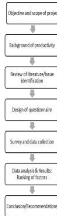
Fig 3.1 Research stages

This investigate, passed through the following stages in figure: