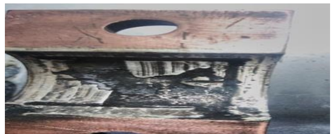
Fig -4: Deteriorated silver contact

mounted on the ball bearings. There is a silver contact present between the ball bearing and the machine shaft which enables the smooth motion of the shaft against the bearings. If this contact is not perfect the motion of the shaft is affected due to friction. The shaft is the unable to properly transfer the rotational motion to the electrode wheel. Required pressure is not obtained for clamping of workpiece for welding. To compensate for this the operator increases the current of the machine or double welds it. The silver contact of the seam welding machine was found deteriorated and was replaced a new silver contact. This resulted in proper clamping and transfer or motion to the electrode wheel. No energy was being lost due to friction and increase in usage of current was stopped.