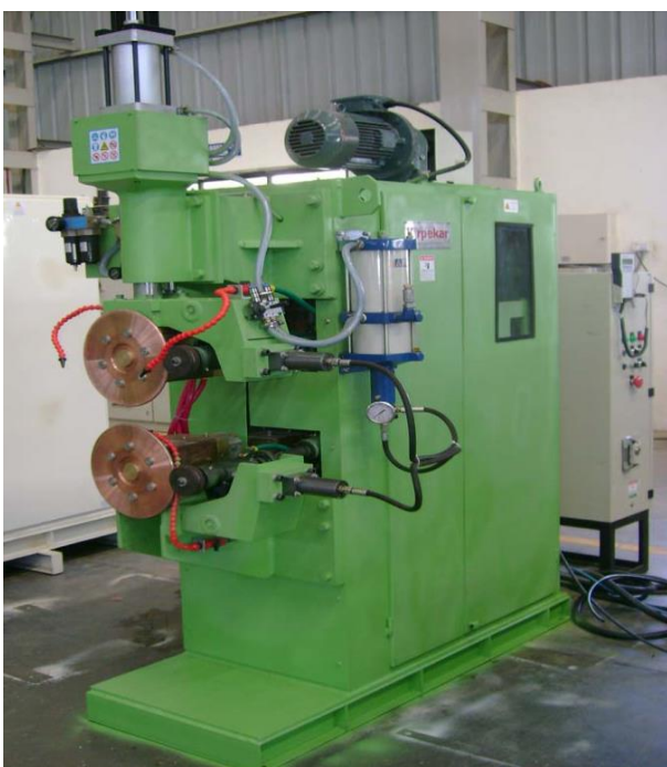
Fig -1: Mechelonic seam welding machine

The experimental set up consists of a longitudinal seam welding machine used to seam weld storage tanks used for oil storage in tipper trucks.