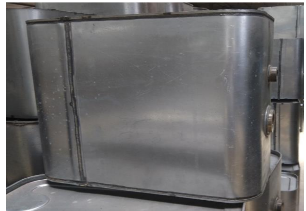
Fig -2: Seam welded storage tank