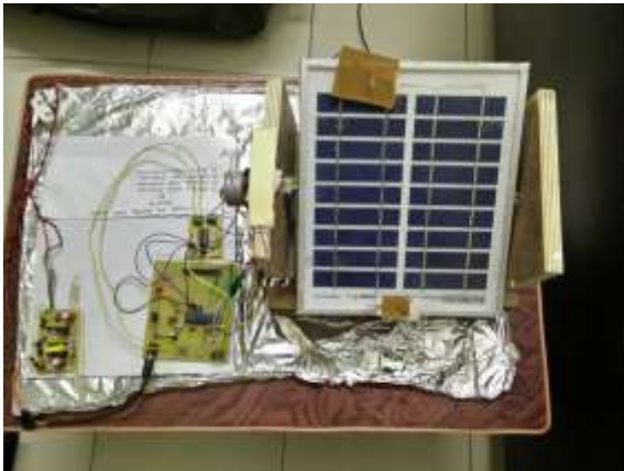
Fig 2.1 hardware

We are using solar panel 6v and 3w, voltage regulator 7805, motor driving IC l293d, rectifier circuit, LDRs, two stepper motors, arduino ATmega328p and transformer.