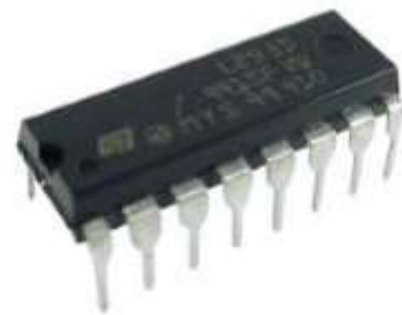
Fig.2.2 Motor driving IC

2.7 Motor driving IC: L293d is dual H-bridge motor driver integrated circuit. Motor driving IC act as a current amplifier since it takes low current control signal and provide high current signal is used to drive the motor.