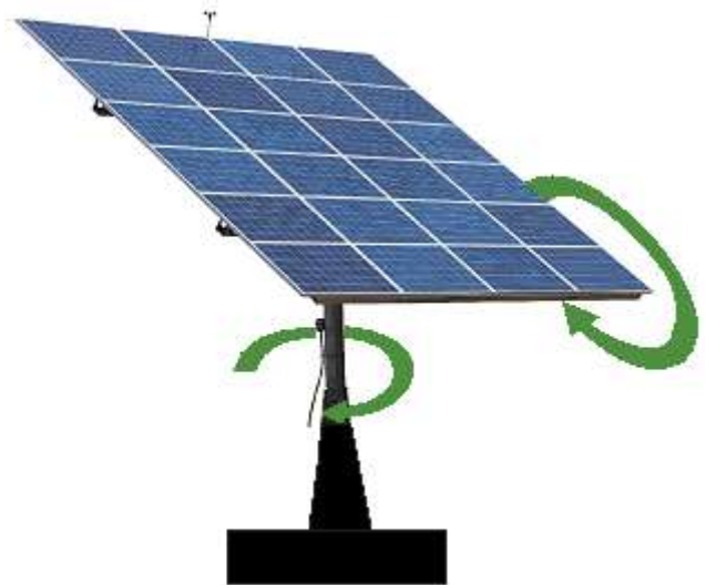
Fig 1 solar tracking system

The sun direction in the sky vary whole day as the sun moves in the sky 0 to 1800. Hence there are also two types of solar tracker: