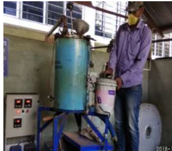
Fig -4: Used Sand feeding arrangement