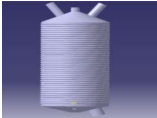
Fig -1: Inner-chamber and heating coil CAD model