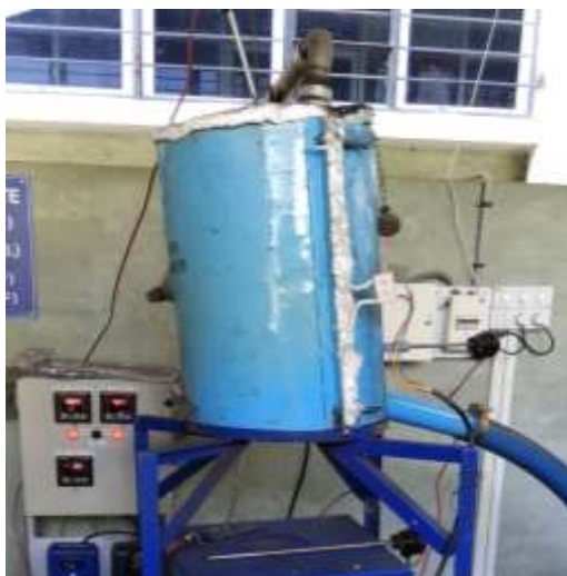
Fig -3: developed FBC setup