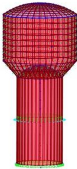
SAP 2000 MODEL FOR INTZE TANK WITH FRAME STAGING