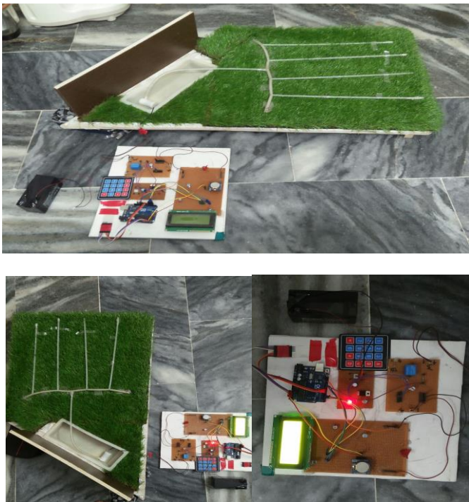
Fig -4: Prototype model of solar water pump with smart time control for power saving application

We have used real time clock [RTC]. which have display real time and real date on LCD by interfacing with the arduino. We have set the time for running of the pump.