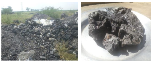
Fig.1 Steel Slag

The steel slag produced during the primary stage of steel production is referred to as furnace slag or tap slag. This is the major source of steel slag aggregate. After being tapped from the furnace, the molten steel is transferred in a ladle for further refining to remove additional impurities still contained within the steel. This operation is called ladle refining because it is completed within the transfer ladle. During ladle refining, additional steel slags are generated by again adding fluxes to the ladle to melt. These slags are combined with any carryover of furnace slag and assist in absorbing deoxidation products (inclusions), heat insulation, and protection of ladle refractories. The steel slags produced at this stage of steel making are generally referred to as raker and ladle slags.