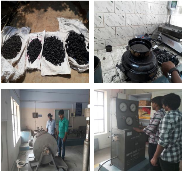
Fig.3 Testing in Laboratory