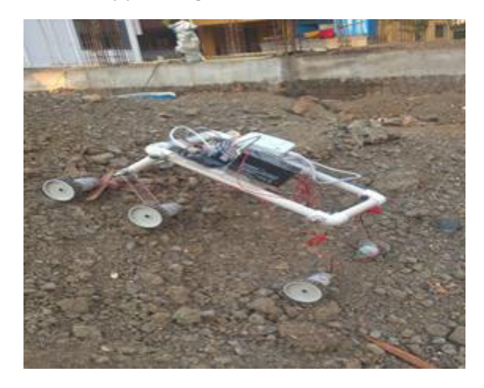
(e) Testing on Small hilly structure of soil