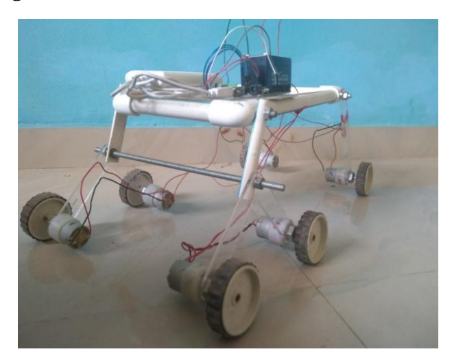
Fig. Actual Model