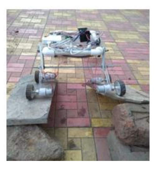
(c) Testing on plane road with obstacles