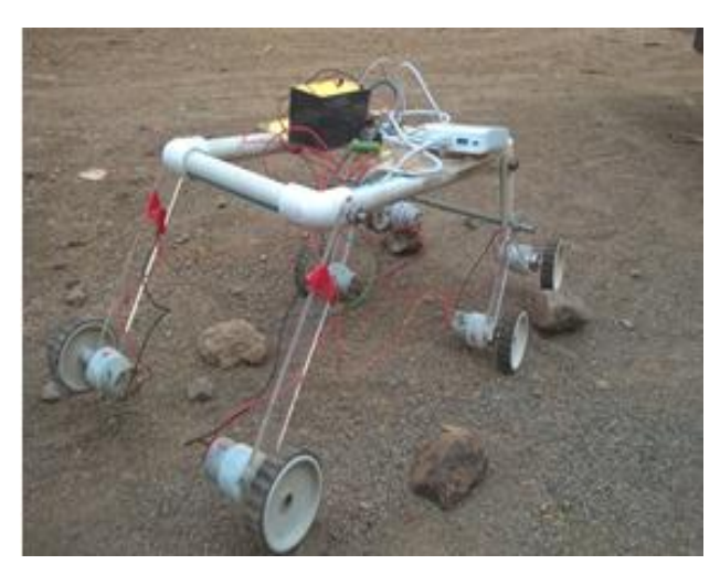
(a) Testing On rocky hill