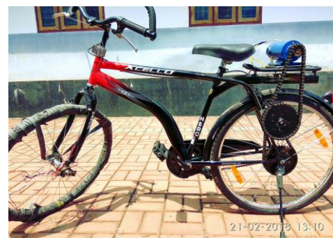
Fig.4. Final Prototype

In our project, we are using a piezo electric power generation system. We are using piezo electric patches which has the piezo electric material in it. These piezo electric patches are fixed in the rim of the wheel. The connection of these patches are done using carbon brushes in the center of the wheel shaft. In the end of the wheel a special roller setup is placed. This roller on tightening, it applies pressure on the tyre and in turn the piezo electric patches receives the pressure. When the cycle starts rotating, When the wooden roller is tightened, the pressure is applied the tyre. This pressure directly applies on the piezo electric patches outside the rim. Due to mechanical force the piezo material starts generating electricity. This generated electricity is stored in a battery. This battery in turn powers the DC motor which is also used to power the chain drive and to wheels.