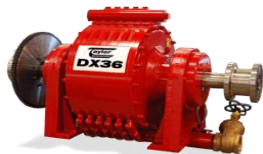
Fig 1.1 Dynamometer