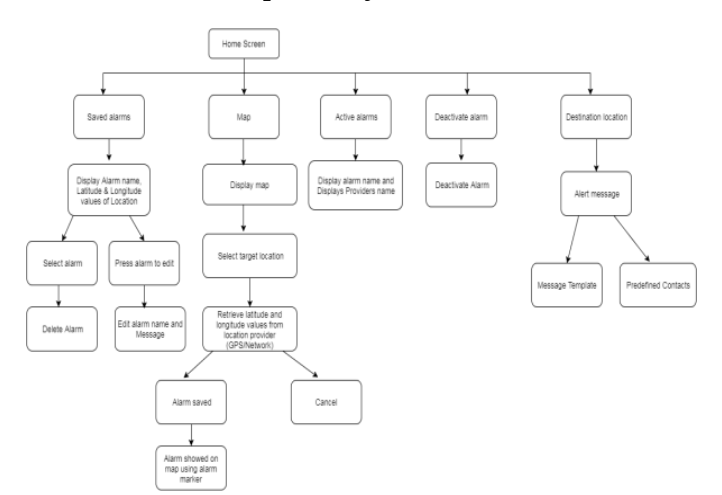
Fig. 4.1: Architecture of Task Trigger

The application provides a number of triggers which can be enabled/disabled by the user as needed. The triggers are: