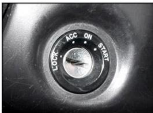
Fig. 3. Ignition key

The term ignition switch is often used exchangeable to refer to two very different parts: the key is inserted into lock cylinder, and the electronic switch that perch just behind the lock cylinder. The ignition switch generally has four positions: off, accessories, on, and open [2].