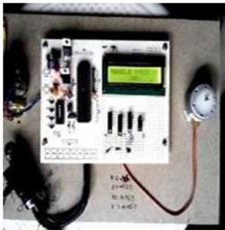
Fig.7. Speed at 100%