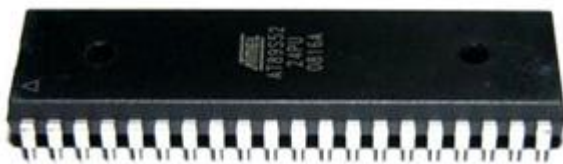
Fig. 2. Microcontroller Pi

The AT89S52 is a low-power, a 8-bit microcontroller with 40 pin DIP. In order to program the controller we are using 8K bytes of flash memory [1].