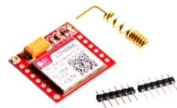
Fig. 3: GSM modem

[2] GSM MODULE: GSM is a mobile communication modem it stands for Global System for Mobile communication. A GSM modem is a specialized type of modem which accepts a SIM card & operates just like a mobile phone. From the mobile operator perspective a GSM modem looks just like a mobile phones. When a GSM modem is connected to a computer this allows the computer to use the GSM modem to communicate over mobile network.