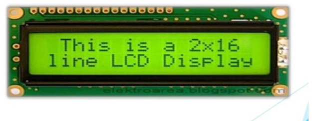
Fig. 4: LCD

[3] LCD: Most common LCD's connected to the microcontroller are 16 x 2 & 20 x 2. This means 16 character per line by 2 line & 20 character per line by 2 line respectively.