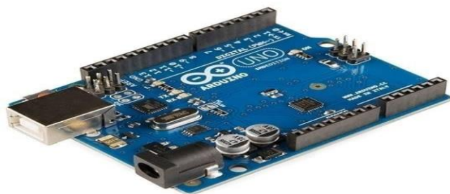
Fig. 2: ARDUINO UNO

[1] ARDUINO: It is an open source computer hardware & software & software company project & user community that designs & manufactures single-board microcontrollers & microcontroller kit. Hardware means arduino circuit & software means where we can type our program or command the arduino. So basically it has two sides like programing to control the project & hardware means arduino device.