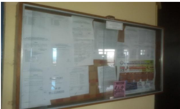
Fig -2: Traditional notice board

Currently our college has mutual system of putting notices on notice board. It's outdated now. As nobody has a time to stand in order to read the notices on notice board. Each Time tables are visible in their own department notice board. It is very difficult for student as well as faculty to view timetable in notice board.