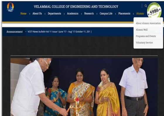
Fig -1: College Website