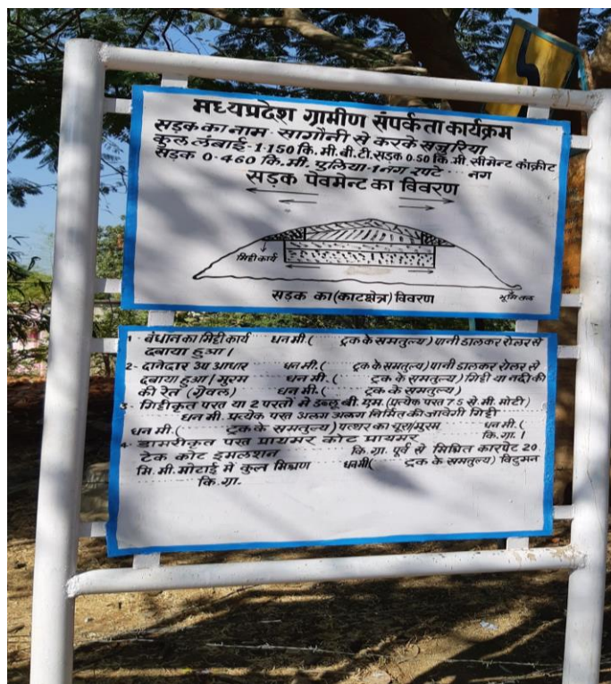
Typical cross sections of rural roads under Malthone block of Sagar District