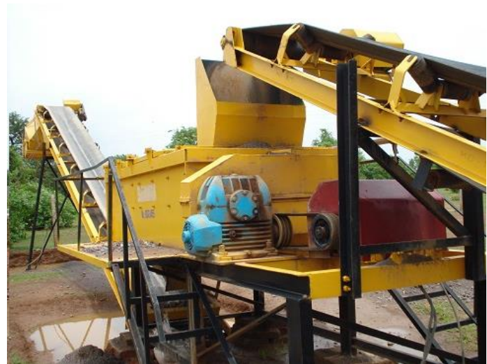
Typical elements of WMM plant

The surface to receive Wet Mix Macadam (WMM) shall be prepared as per sub-section 405. WMM shall be prepared in an approved mixing plant with mixing arrangements like the pug mill or pan type mixer of concrete batching plant. For small quantities of WMM, the Engineer may permit the use of concrete mixers. Optimum moisture for mixing shall be determined in accordance with IS:2720 (Part 7) after replacing the aggregate fraction retained on 22.4 mm sieve with material of 4.75 mm to 22.4 mm size. 3. Section-400 61 Quality Assurance Handbook for Rural Roads