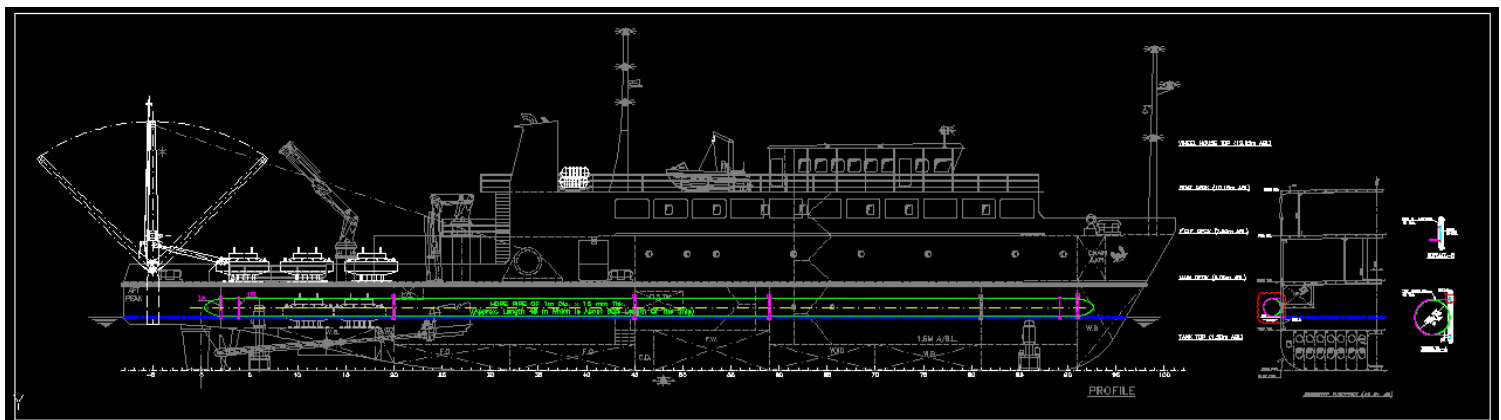
Fig - 1: Vessel with Side hollow pipe Option 1

These partially filled tanks consist of two wing tanks connected at the bottom by a substantial crossover duct. The air columns above the liquid in the two tanks are also connected by a duct. As in the free surface tanks, as the ship begins to roll the fluid flows from wing tank to wing tank causing a time varying roll moment to the ship and with careful design this roll moment is of correct phasing to reduce the roll motion of the ship. They do not restrict fore and aft passage as space above and below the water-crossover duct is available for other purposes.