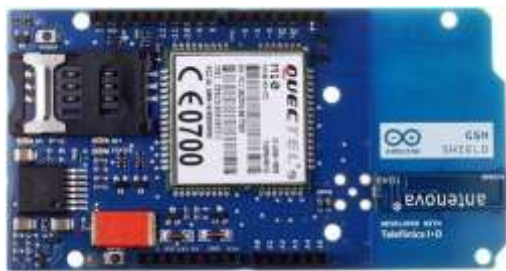
Fig. 4: Arduino GSM shield V1

The Arduino Uno differs from all preceding boards because it does not use FTDI USB to serial driver chip. As an alternative, it features the ATmega8U2 programmed as a USB to serial converter. Revision 2 of the Arduino Uno board has a resistor pulling the 8U2 HWB line to ground, making it easier to set into DFU mode.