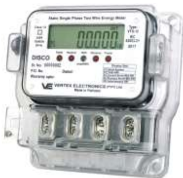
Fig. 2: Electronic Energy Meter

After calculating the energy consumption the message was sent to the customer through SMS. If the network is failure then the message are not delivered to the customer. If the payment period exceeds the energy provider employee need to go to each and every house to disconnect power supply. Fig. 2 shows the electronic energy meter.