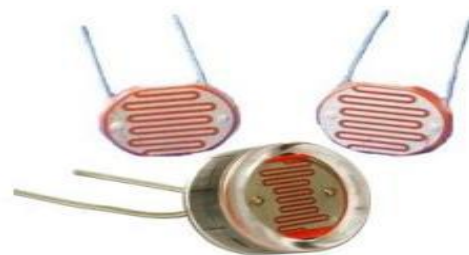
Light Dependent Resistor (LDR)

Ldr are also named as photo conductors (or) photo resistors. This works on the principal of photo conductivity. Ldr resistance decrease with increase in light intensity and vice versa. Ldrs are mainly used for sensing purpose in order to catch the solar energy and provide analog input to arduino.