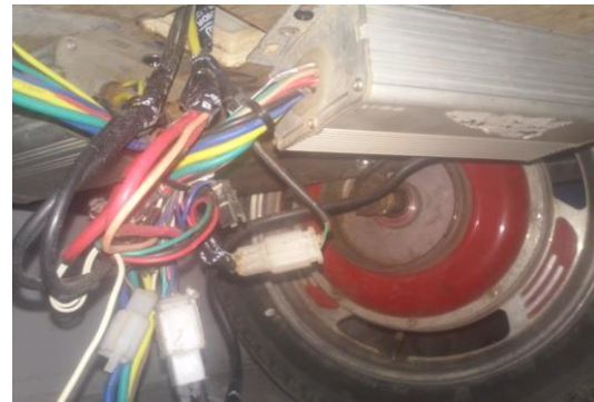
Fig 2:DC motor power controller

Power controller is used to control the DC motor speed which are fitted at bottom.