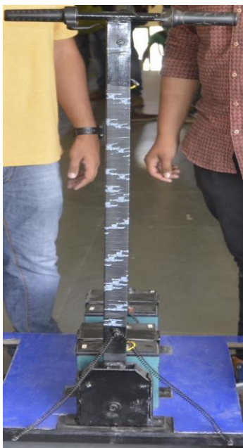
Figure-3 Control Shaft

Control shaft is a vertical axle or support which controls the handle for vehicle. Handle is used for steering the control shaft.