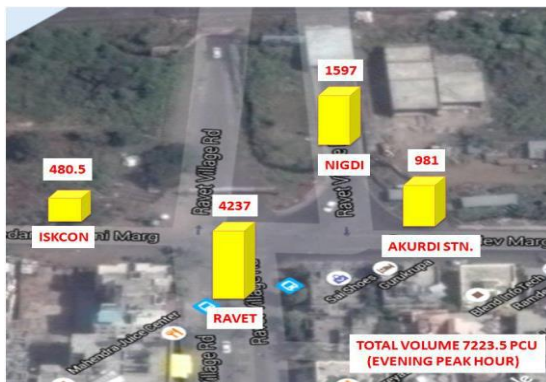
Fig.1.Showing Peak hour PCU

Traffic volumes studies are mainly carried out to obtain factual data concerning the movement of vehicles. Observations are mention (PCU Counts) in the figure.no1. Based on PCU Counts verse time graph was plotted. Figure no 2, shows the variation of PCU count in one day. The maximum PCU recorded is 7000 and minimum as 2000.As per IRC standards the PCU 1200 for two lane road. On an average 5000 PCU is recorded which is three times greater than permissible.