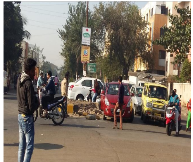
Fig.2.Over Drive Of Vehicle On Island Due To Improper Arrangement Of Island