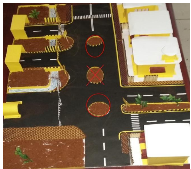
Fig.5. CASE STUDY – DHARMRAJ CHOWK (Island should be redesign to avoid vehicles collision and illegal passing at intersection)