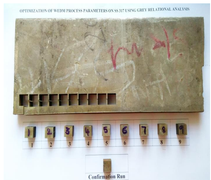
Fig -3: Specimens after machining.