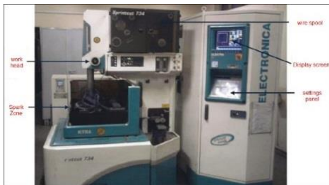
Fig -1 Wire Electric Discharge Machine

SS 317 is used as target material in the present investigation. Experiments were performed using Electronica Maxicut Wire EDM as shown in "Fig.1."