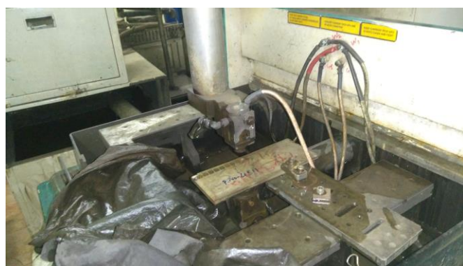
Fig -2 Material in Fixture

A 0.25 mm dia brass wire was used as an electrode to erode the metal under distilled water. A small gap of 0.025 mm to 0.05 mm is maintained in between the wire and work-piece. The size of the work piece considered for experimentation is 10 * 10 * 10 mm 3 . The process parameters were being set in the WEDM machine and the experiments were conducted as