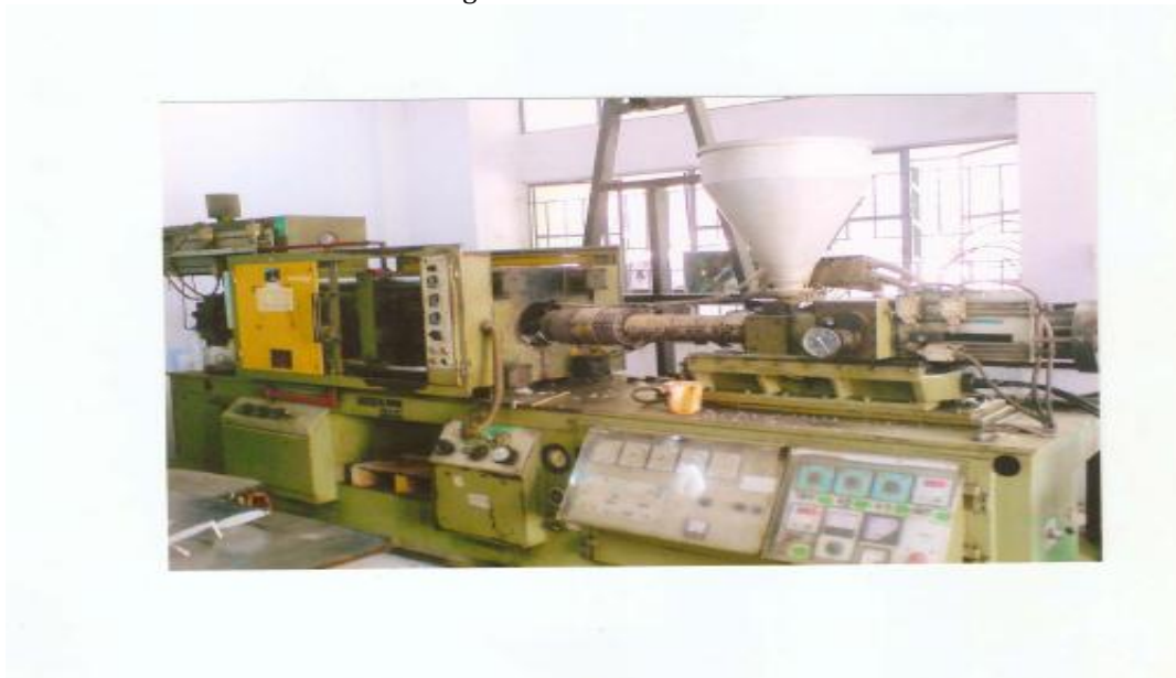
Fig 7.2 injection moulding

The outcome of material is tested for various properties such as tensile, flexural, impact and hardness in the strength of materials laboratory. The outcome material dimension is 15*20*3mm. The output specimen is immersed on the ground water for 24 hours.