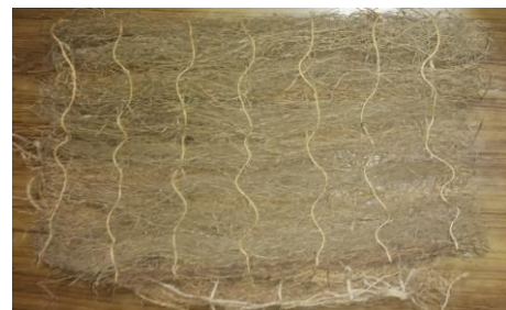
Figure: 3.1. Khus cooling pad