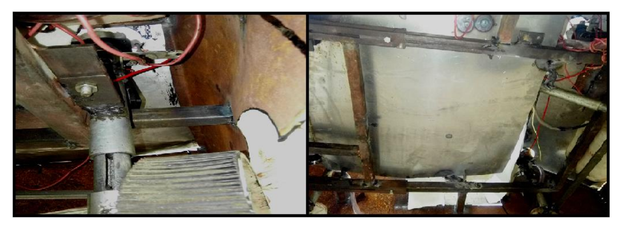
Fig.: Motorized jack and chassis adjusting.

In order to avoid all such disadvantages, the automated motorized electric lifting jack has been designed and adjusted in such a way that it can be used to lift the vehicle very smoothly without any impact force. The operation is made simple so that even unskilled labour can use it with ease. The D.C. motor is coupled with the lead screw by gear arrangement; the lead screw rotation depends upon the rotation of D.C. motor. In the D.C. motor is also implemented in the chassis for the length adjustment according to need and space. This is an era of automation where it is broadly defined as replacement of manual effort by mechanical power in all degrees of automation. The operation remains to be an essential part of the system although with changing demands on physical input, the degree of mechanization is increased.