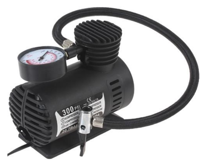
Fig.: Tire pressure monitoring and automatic air filling system.

Service: Compatible gases, steam, liquids or vapours. Accuracy: ±0.075% Range ability: 100:1 Stability: ±0.125%