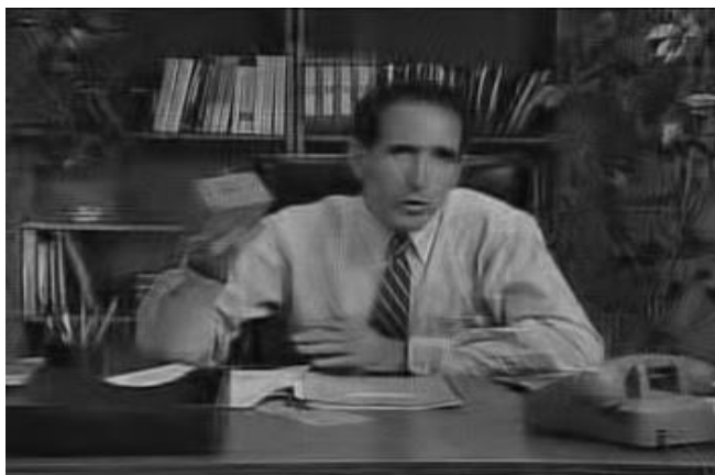
Fig.3. Denoised frames using proposed technique

The denoising using proposed approach gives following frames in Fig.3.