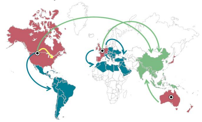
Figure 2: BDMs classification as per Location

Offshoring continues to be the predominant delivery model for IT companies, however IT companies also invest in onshore and nearshore locations to balance the business ecosystem as per the local legal requirements. This results in a hybrid delivery model, which is also known as Global Delivery Model. In Global Delivery Model, projects are executed by combination of two or more of aforesaid business delivery models.