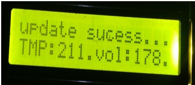
Fig -3: user control panel display.