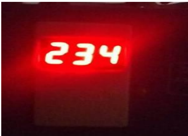
Fig -4: Alternating voltage user panel display.