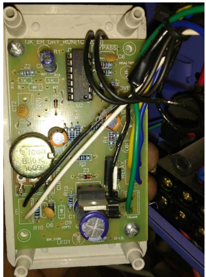
Fig -2: Electronic unit hardware module of system.