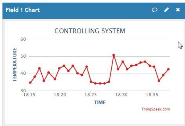
Chart -1: controlling system Temperature

For which a advance sensing algorithm is implemented . where a float switch is implemented in tank. When tanks gets above to filled completely then a float pressure switch is kept which blocks the water inlet pressure. Which in turn system monitors the pressure running through motor outlet. If it is block above the tank inlet then it pressure increase motor outlet. Systems comes to know that tank is filled and shutdowns the motor.