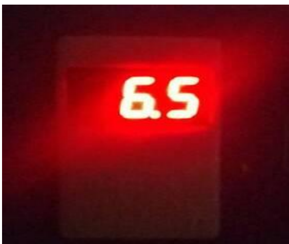
Fig -5: Alternating current user panel display.