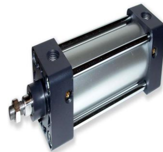
Fig-02: Double acting Pneumatic cylinders

Pneumatic cylinders are mechanical devices which use the power of compressed gas to produce a force in a reciprocating linear motion. Like hydraulic cylinders, something forces a piston to move in the desired direction. The piston is a disc or cylinder, and the piston rod transfers the force it develops to the object to be moved.