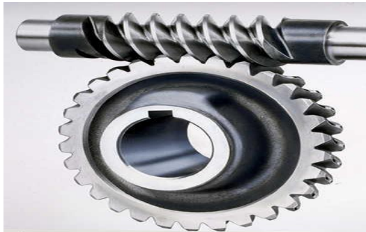
Fig-03: worm & worm wheel gear

Worms and worm gears are gear sets that offer high gear reduction and torque multiplication with a small footprint. A worm drive is a cylindrical gear with a shallow spiral thread that engages the worm gear in a non-intersecting, perpendicular axes configuration.