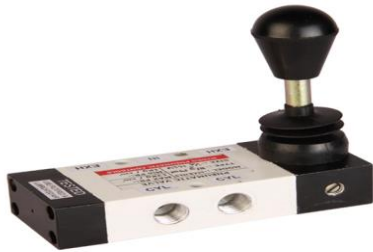
Fig-02: Directional control valves