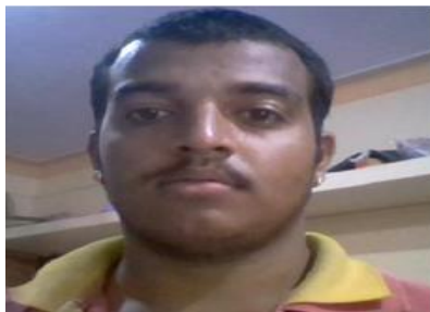
Fig.3.Face Detection Location and tracking

The basic need for face recognition is face detection. Face detection takes place because the camera detects the image of the user. System object is formed to observe the placement of a face in an input face image. The cascade object detector uses the Viola-Jones detection algorithmic program for face detection. By default, the detector is designed to detect faces. Using cascade object face region is tracked and with the assistance of extra properties like bounding box, tracked face region is delimited with parallelogram box. Face Detection and tracking is shown in figure.3. Eye localization is shown in figure 4.