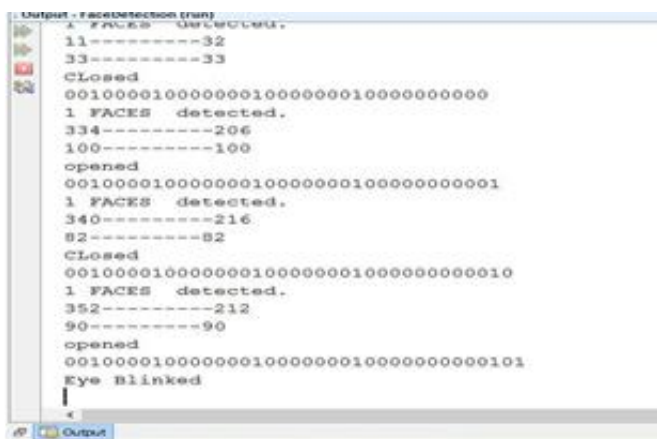
Fig. Liveness check (eye blinking)