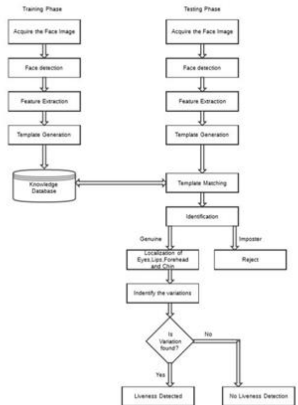
Fig. Operation flow

The system provides the protection to FR based attendance system by authenticating the user with face attribute along with aliveness detection using variations in eye movements i.e. blinking. The designed model is reinforced by providing the protection in 2 phases i.e. performing authentication and aliveness checks. The designed system for the projected system is as shown within the Fig.1. Commencement within the planned model is getting the image of face biometric modality. Further, localization of facial portion is to be carried using Viola Jones methodology. The feature extraction is that the vital steps in any biometric system. Extract the native regions of the detected face and find eyes locations to extract the options using native Binary Pattern (LBP) operator. The extracted feature vectors i.e. template are to be hold on firmly within the information. Hence, construct the templates from extracted options individually. Throughout identification, compare the stored template from the information with the generated feature vector of the user using template matching. If matching is successful then perform the aliveness check using the variations in native regions of eyes. If there's a variation in these native features, then user is alive else user isn't alive.