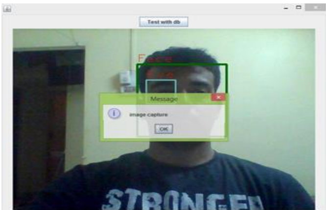
Fig. Image Capture