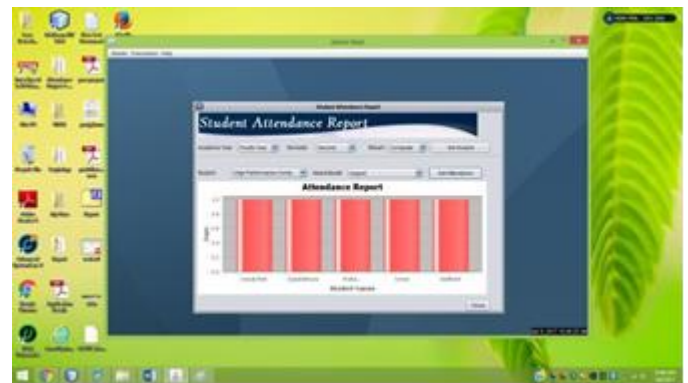
Fig. Attendance Report