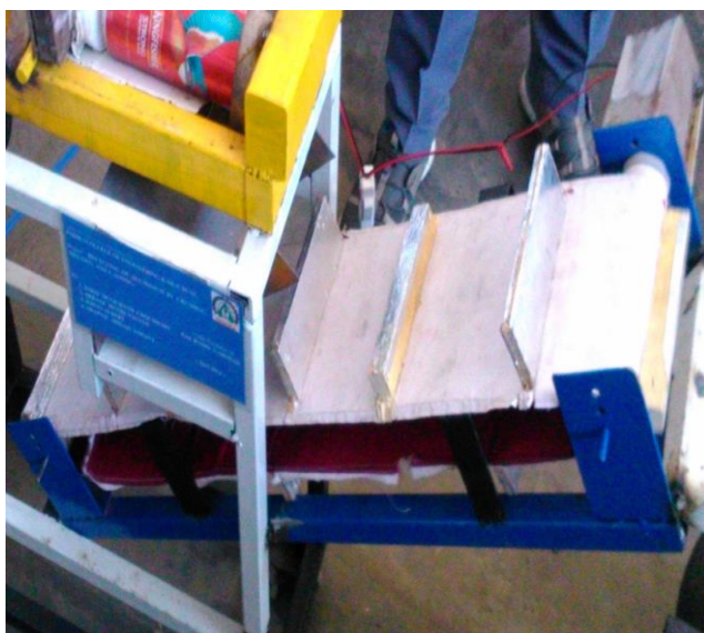
Fig No 5- Conveyor belt

The conveyor has a 30rpm 12v dc motor. This motor is powered by 12V dc battery. The motor is actuated using a 1 way switch. As the switch is actuated the power is transmitted to the motor through the battery. The motor drives the metal shaft. The metal shaft is connected to the Roller pulley of the conveyor by a roller bearing. The roller bearing transmits the motor power to the PVC pipe without much friction. The fabric cloth is wrapped around the two PVC pipes. These two pipes act as the roller for the conveyor belts. The fabric cloth has wooden planks on it. A motor of 30 rpm has been selected to meet the speed requirements of material handling and to also ensure the rate of process is not slowed down. Initially during the project a motor of 10 rpm was selected but it wasn't able to keep up with the speed required. Hence we switched to a 30 rpm motor which ensured a good speed for material handling and also didn't hamper the overall recycling time.