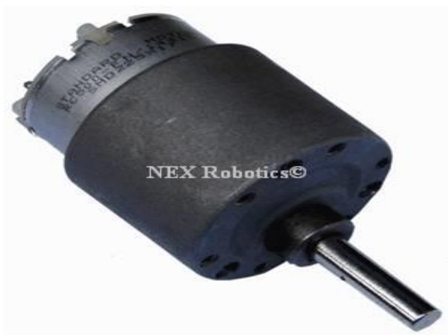
Fig No 4- Motor