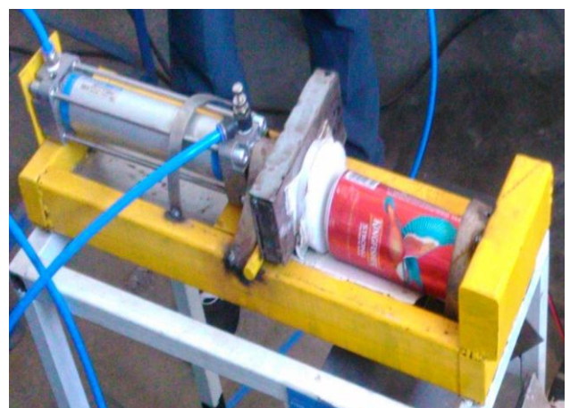
Fig No 3- Crushing Unit