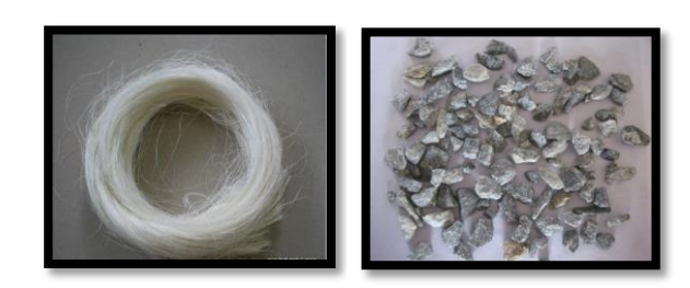
Fig.3 Sisal Fibre Fig. 4 Coarse Aggregate