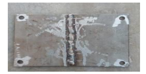
Fig -1: Test on welded specimen

After following those given procedure on welded specimen inspection we got following defects indication some of those are given below on figure.