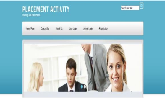
Fig 3.1: main page This is the main page of placement website 2. Student Registration page