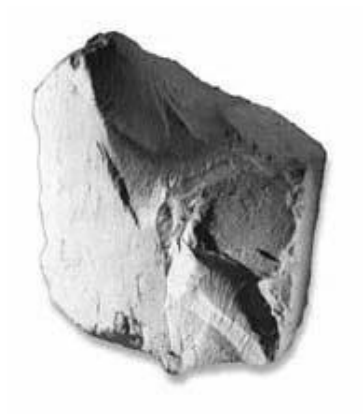
Figure: 3.2 frame of kaolin

Structurally, in the kaolium there are alumina acetadral sheets and silica tetrahhedral sheets which are alternately surrounded with the theoretical structure of 46.54% 39.50% and 13.96% of water. The arrangement of atoms in the Covalent Group is shown in Figure 3.2.