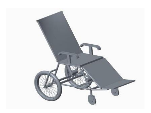
Fig.1: Design of Wheelchair