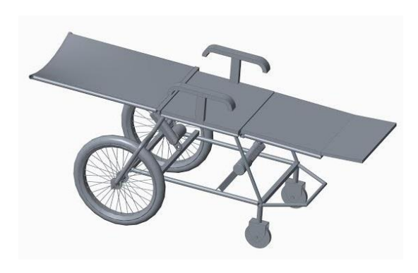
Fig. 2: Stretcher Assembly in PRO-E