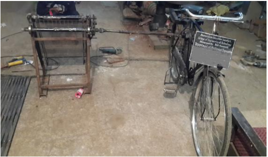
Fig. 6 drain cleaner