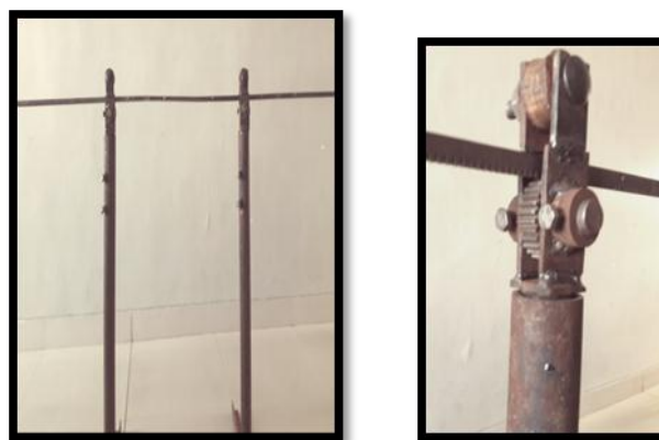
Fig 2 : Mechanical Assembly

The stepper motor which is on the line for the paint rod, is connected with the gear motor timer of the motor to have a exact, safe and appropriate functioning of the painting job.